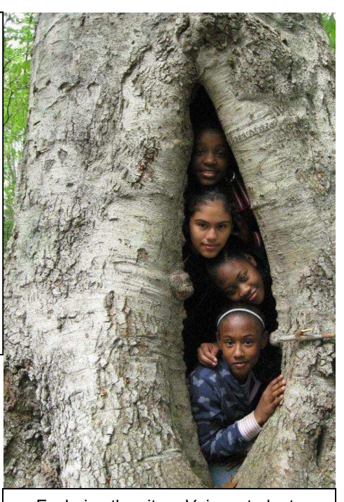
Exploring the site - Voices students