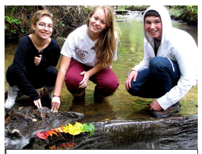
Students creating art from autumn leaves in a stream.

The Voices from the Land (Voices) project is an exploration and celebration of oral and written language... of science, art, performance... and the human imagination. Voices projects can be done with people of all ages and abilities... in any landscape... using any language.