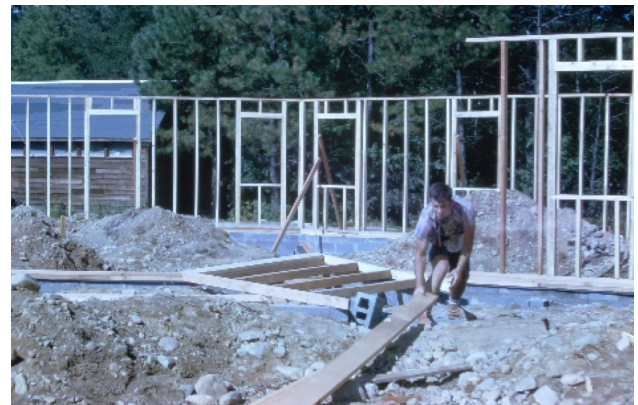
Lenape Lodge under construction.

In 1965, Camp Sequoia was used by the Garden School for Emotionally Disturbed Children, providing a one-week camping experience for organically brain-damaged children. In 1966, Camp Sequoia was leased to the Salem County School Districts to conduct a six-week camping program for culturally and socially deprived children. For some years after this camp program ended, Camp Sequoia functioned exclusively as a base for teaching summer graduate courses for Montclair State College. (6)