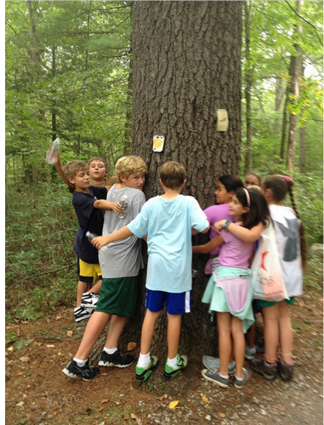
Residential school program students.

Although the School of Conservation has always transformed and evolved to address the changing needs of students and educators, in many ways its success and endurance as an institution of learning lie in its original approach to instruction: discovery through field study.