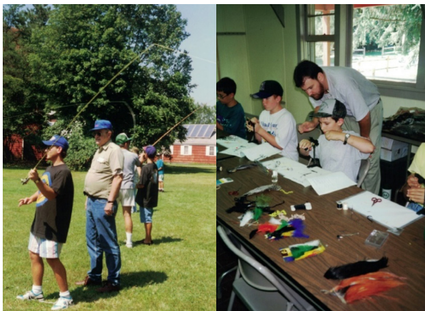
Junior Fly Fishing School.