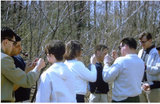
College students studying Forest Ecology.

be utilized during their student teaching experience. The lack of relevance was a major criticism leveled at many resident programs in Outdoor Education and Conservation (3)—and with considerable merit. The shift to the college junior year negated such criticism and also tied the experience more closely to the school curriculum with which these future teachers were beginning to work.