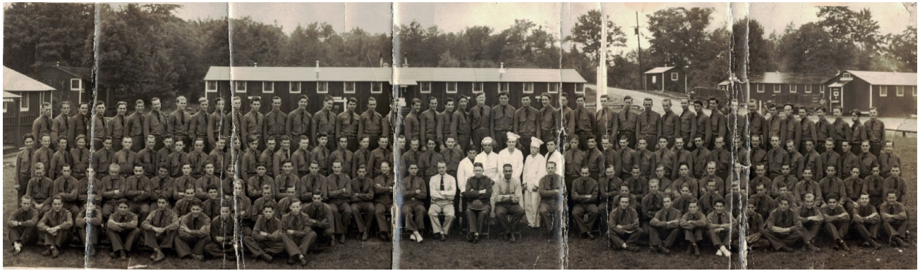
CCC camp pictured near Long House.