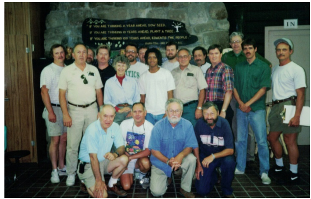
Junior Fly Fishing School staff.