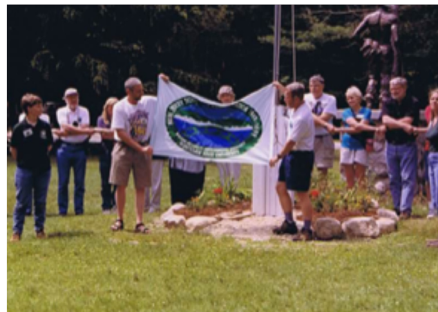
Raising the 50th Anniversary flag.