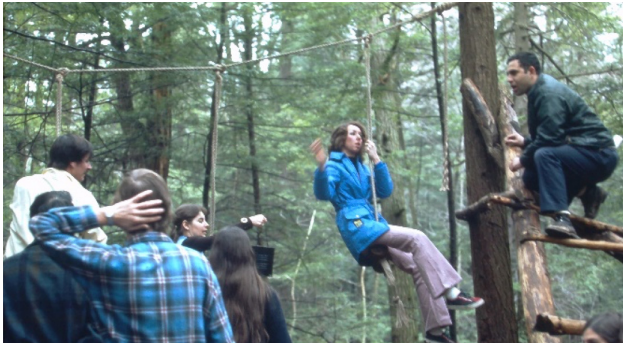
Action Socialization Experiences.

new perspectives to the traditional programs of the School and research and collaborations with the Natural and Historic Resources program of the New Jersey Department of Environmental Protection and other institutions were established.