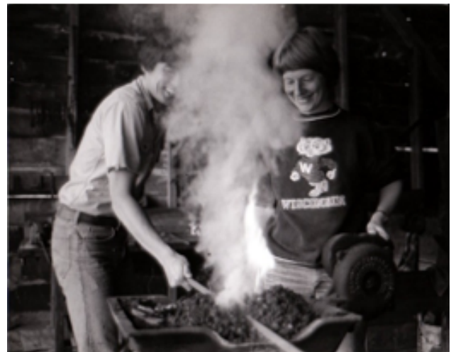
Blacksmithing with undergraduate students.