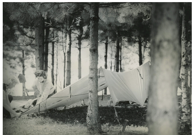
Pitching a tent at Piney Point.