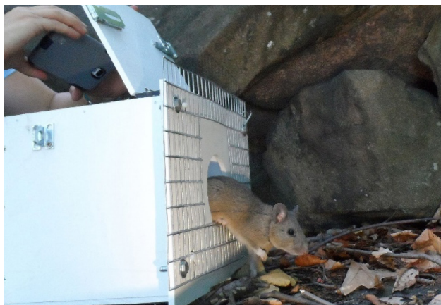
Release of a radio-collared vole.

Montclair professors and their graduate students from 14 academic programs work and study at the SOC. The diverse habitats of the SOC have enabled graduate students, post-doctoral fellows, and university faculty members to carry out significant research in ecology, conservation, animal behavior, systematics, biological diversity and evolutionary biology. Much of the research is a collaboration between the SOC, the Endangered Species and Nongame Species program at the New Jersey De-