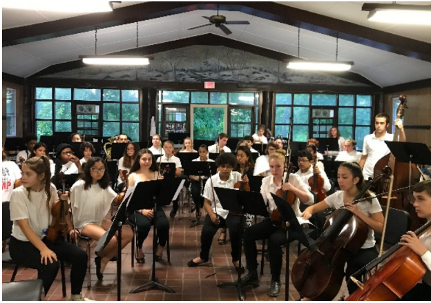
Music Ecology Camp performance in Big Timbers.

In addition to music, campers also enjoy the traditional camping activities such as boating, swimming, canoeing, and forest, wildlife, and water ecology. (6) The music camp is now celebrating its 26th year of teaching young artists by immersing them in a natural setting so they may create and appreciate the music that nature inspires.