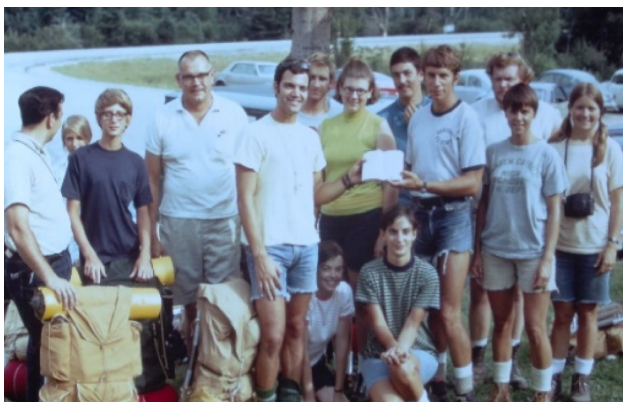
Prospective Teacher Fellowship Program.

In the summers of 1968, 1969, and 1970, the School of Conservation served as the field campus for a federally funded graduate program under Title V of the Higher Education Act. This program was jointly sponsored by Glassboro State College, Montclair State College, Trenton State College, and the School of Conservation. The courses at the three colleges and the School of Conservation were designed to provide experienced teachers with a philosophical base and the technical skills to conduct environmentally-oriented field programs and to modify existing curriculum in order to focus on conservation and environmental problems that were threatening all people.