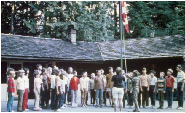
Metropolitan Toronto and Region Conservation Authority, Ontario, Canada exchange program with SOC staff.

of Cook College, the former Agriculture School of Rutgers University. At the request of the Dean, the School of Conservation faculty jointly developed the first environmental education curriculum course to be offered at Rutgers University. Students were enrolled in the fall of 1970 and the course was team taught by all five faculty members.