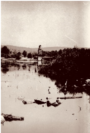
Water tower and lake during the CCC and early SOC days.

The story of the New Jersey School of Conservation begins in 1924 when officials in the State Department of Conservation purchased the Skellinger Farm for the price of $100 and added the property to the Stokes State Forest system. Stokes State Forest was established in 1907, after New Jersey Governor Edward Stokes donated some of his own holdings. His acreage was combined with other land either donated or confiscated from people delinquent in property tax payments. (6) In 1934, the Civilian Conservation Corps (CCC) moved onto the Skellinger site, cleared some of the land, built an earthen dam across a cornfield and the mountain stream used to irrigate the land, and created an 11.3 acre body of water now known as Lake Wapalanne.