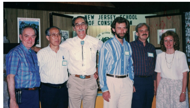
NJ SOC 40th Anniversary speakers.