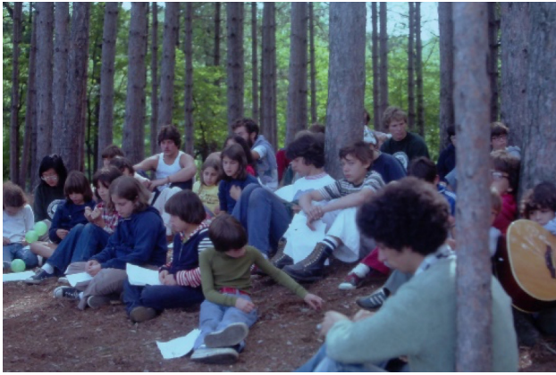
Devotions at Piney Point.

to undertake during this allotted time. On Sunday evening, the plans developed with the campers would be reviewed with the Camp Director, Program Director, and Environmental Studies Coordinator to ensure that the areas to be studied and their presentation would effectively meet the educational goals and objectives established by the camp.